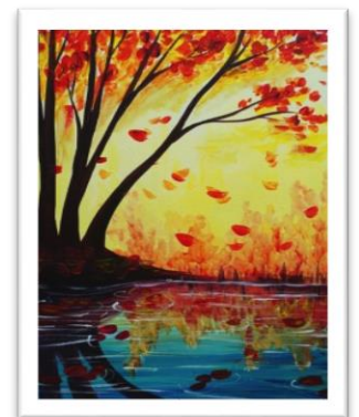
Painting will be fall themed similar to image above

Items to Bring: A dish to share, your favorite refreshment and an apron or smock.