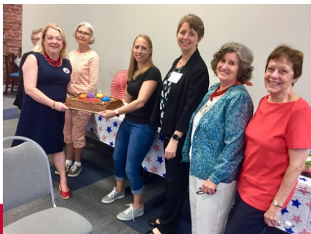
LWVFRA 19-20 Board Members